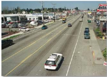
EXHIBIT 5 Project Alternatives for the Example Application

Exhibit 5 illustrates and describes the three project alternatives: a no-build scenario, Alternative 1 and Alternative 2.